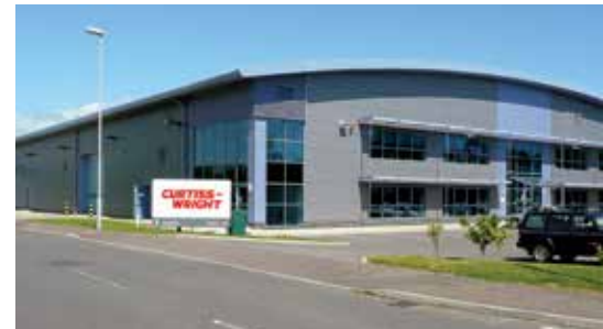
Solent & Pratt's Headquarters in Bridport, UK

With today's demand for process plants and oil and gas platforms to run for long periods between shut downs and to control emissions to very tight limits, butterfly valves have undergone recent developments. These developments are in size, materials, tight shut off and pressure class ratings to provide a real, reliable, economical and almost emission free alternative to traditional globe, ball, gate, plug and control valve designs.