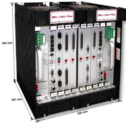
MicroNet Plus Control Chassis (8 VME slot option)

Power supplies may be simplex or redundant in any combination of input voltages.