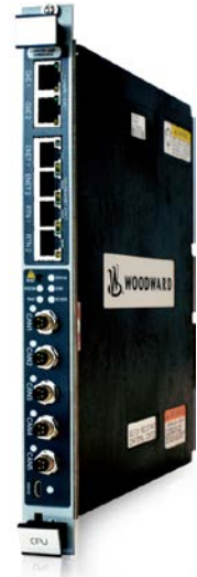
MicroNet Plus CPU5200

The MicroNet Plus control system incorporates an SNTP version 4 compliant timeserver that enables the control to be synchronized to less than 1 millisecond of any other external time source. Time stamping of sequence of events can be accomplished to 1 ms resolution on Discrete I/O and to 5 ms resolution on Analog I/O and software process variables.